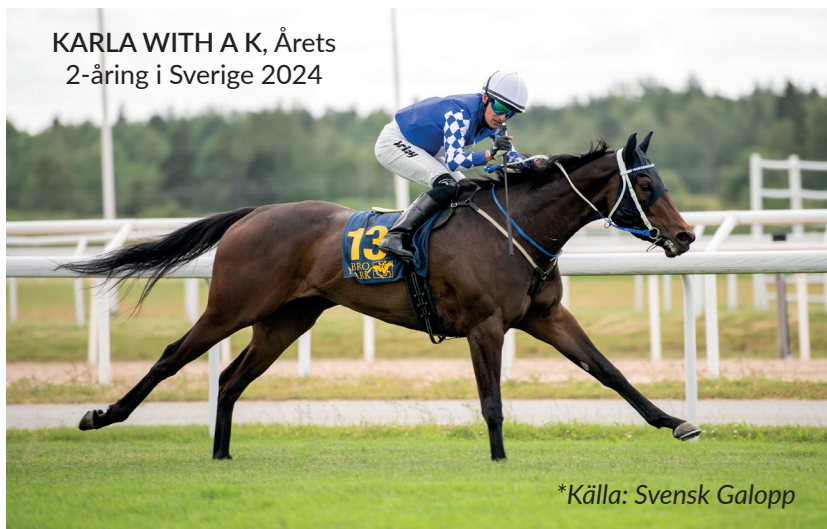
KARLA WITH A K, Årets 2-åring i Sverige 2024

Vi har fött upp 34 miljonärer, på senare tid KARLA WITH A K, LITTLE ARABELLA, DISRAELI, IRON BUTTERFLY, SCARLETT, DOLLY DAGGER, GO ON CARLRAS, MOUNTAIN, m fl.