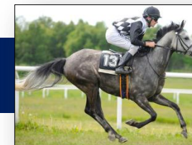
Maggia, uppfödd av Onsala Arabians AB

Övr = övriga prisplaceringar. Opl = placeringar utan prispengar. Pr st = prispengar (inkl bonus) per start.